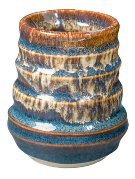
DL-11 Enamel White over DL-33 Low Tide