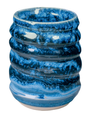
DL-1 Ebony over DL-23 Ultramarine