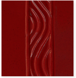
DL-59 Brick Red