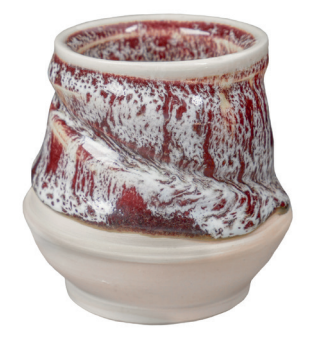
DL-11 Enamel White over DL-70 Oxblood