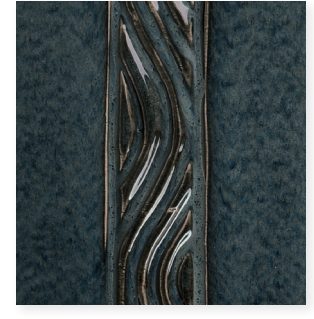
DL-12 Midnight Blue