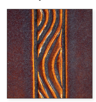
DL-33 Low Tide