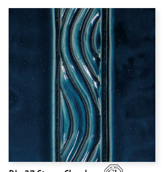
DL-27 Storm Cloud