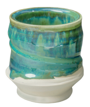
DL-70 Oxblood over DL-42 River Moss

Layering examples glazed on AMACO A-Mix White Stoneware No.11. Fired to Cone 6.