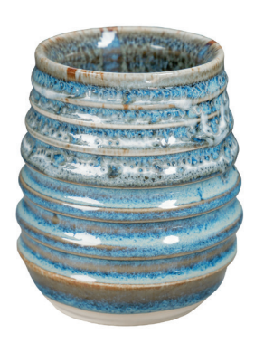
DL-11 Enamel White over DL-20 Floating Blue

The power of Dipping and Layering glazes is in the layering! Create visually stunning and unique effects, enhance color depth, and take your work to the next level!