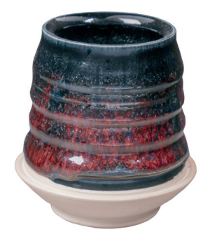
DL-70 Oxblood over DL-1 Ebony