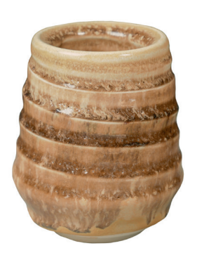
DL-70 Oxblood over DL-60 Honeycomb