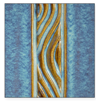
DL-20 Floating Blue