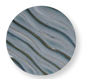
PCF-3 Midnight Run