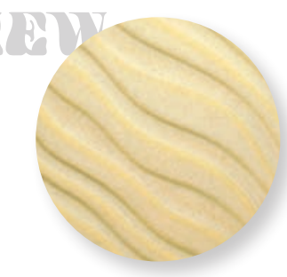
PCF-60 Sun Beam