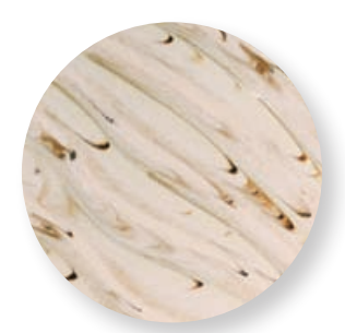
PCF-74 River Birch