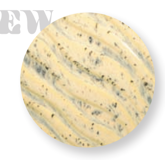
PCF-63 Sun Shower