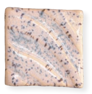
AMACO No. 16 White Chocolate

Clay body can affect your work just as much as glaze. Check out how PCF-16 Aurora Breeze shifts from clay body to clay body.