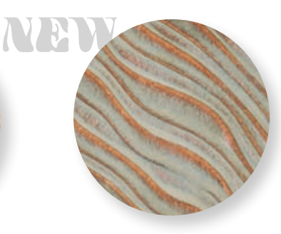
PCF-33 Mystic Tide