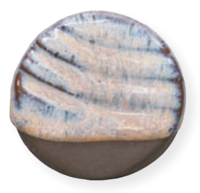
AMACO No. 32 Dark Chocolate