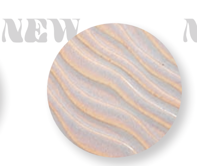
PCF-36 Rose Mist