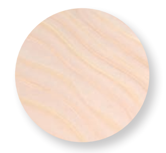
PCF-54 Flux Blossom