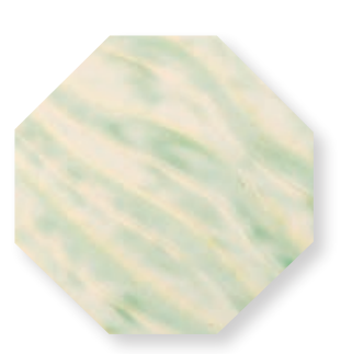
PCF-75 Moss Mist