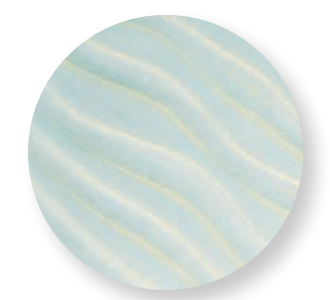
PCF-19 Cirrus Flow