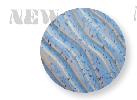
PCF-21 Ocean Drift